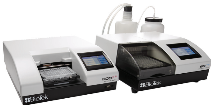
BioTek's 800™ TS Reader is ideal for pairing with 50™ TS Washer for routine workflows.